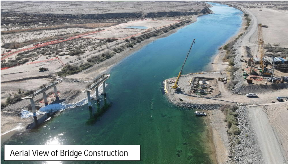
Aerial View of Bridge Construction