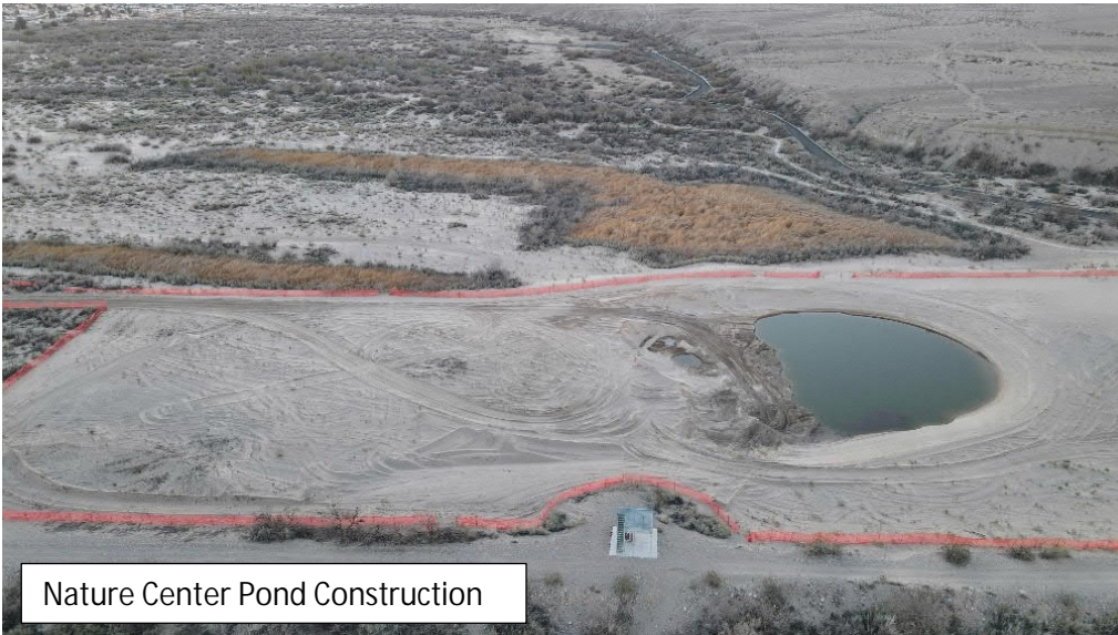
Nature Center Pond Construction