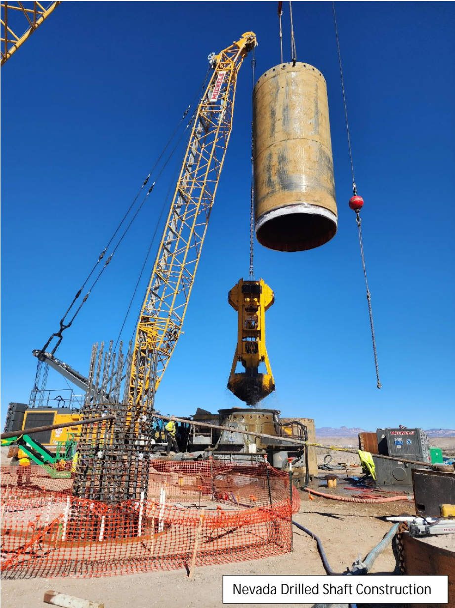
Nevada Drilled Shaft Construction